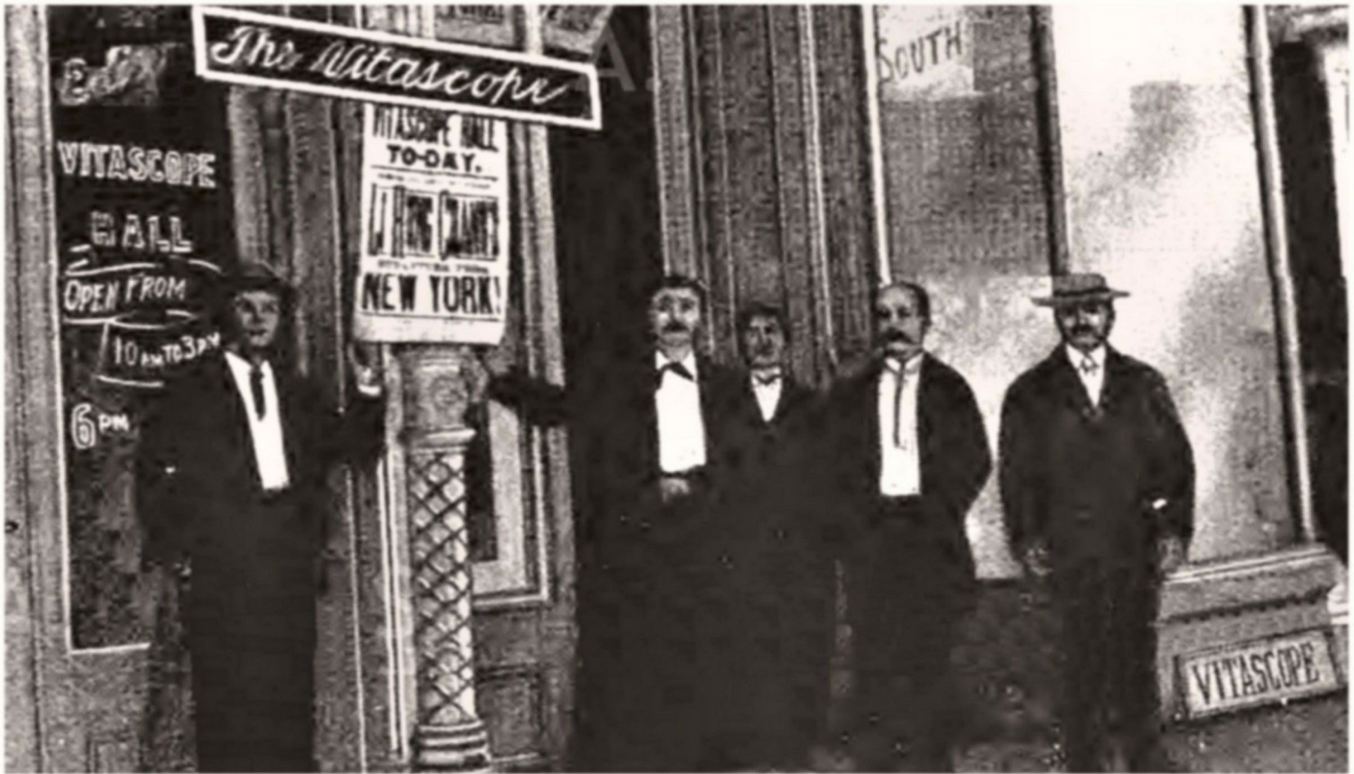
Vitascope Hall ~ 623 Canal Street ~ New Orleans, LA ~ July, 1896

Vitascope Hall, 623 Canal Street, New Orleans, the first seated indoor theater in the United States, is finally receiving an historic marker commemorating the location where American theatre-goers got their first glimpses of the technology that added motion to pictures.