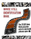
Movie Still Identification Book