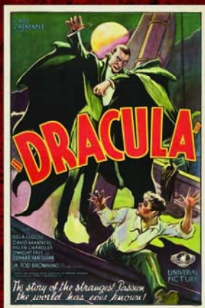
Dracula (Universal, 1931) One Sheet (27" X 41") Style F Sold for: $310,700 March 2009 HA.com/7003-002004