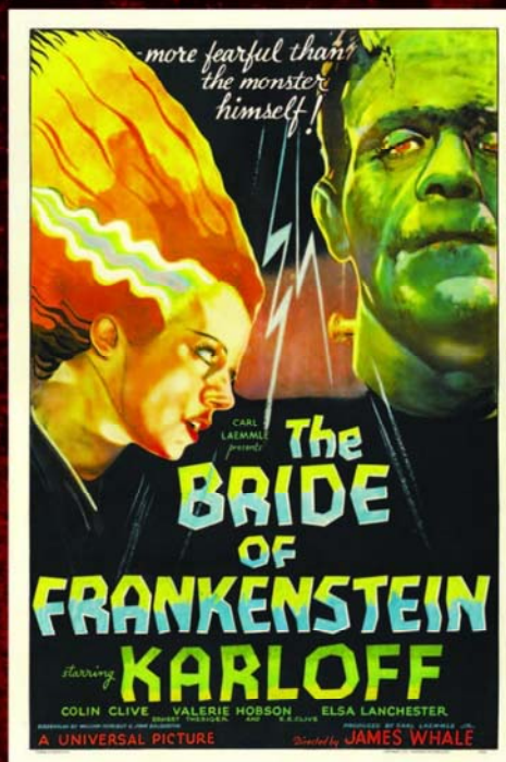
The Bride of Frankenstein (Universal, 1935). One Sheet (27" X 41") Style D. Sold For: $334,600 November 2007 HA.com/667*29167

You want the most for your years of careful collecting, and Heritage – more so than anyone else – can get it for you. Take no chances; consign today and see why we're the most trusted name in the business of collectibles.